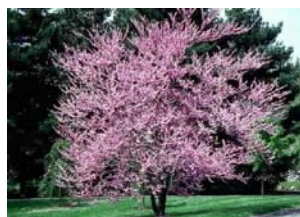
#15 'Eastern' Redbud (Reg. $109.99)