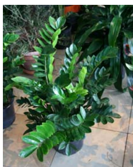
The Incredible ZZ

Houseplants are great for so many reasons. They help to clean and purify the air inside your home, many of them are low maintenance and they add color to your home as we get closer to the dreariness of winter. The Moana Lane greenhouse is stocked with a wide variety of amazing, easy to grow, low water, low to medium light plants that will thrive in your home or office.