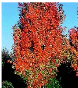
#15 'Bowhall' Red Maple (Reg. $119.99)