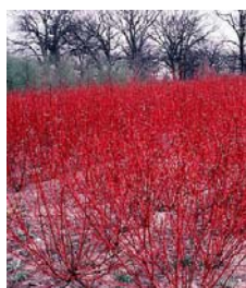
#5 Redtwig Dogwood (Reg. $28)