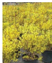
#5 'Lynwood Gold' Forsythia (Reg. $28)