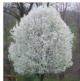
#15 'Redspire' Flowering Pear (Reg. $109.99)

Limited to stock on hand. Selection ends October 4th.