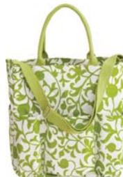
Great Summer Bag