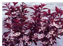
#5 'Cistena' Plum $15 (Reg. $29.00)