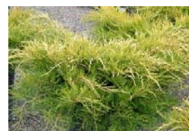
#5 'Old Gold' Juniper $15 (Reg. $28.00)