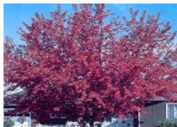
#15 'Brandywine' Flowering Crabapple