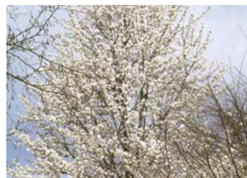
#15 'Chanticleer' Flowering Pear