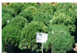
#3 Dwarf Mugo Pine $15 (Reg. $32.99)